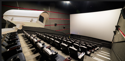
Entertainment and Media