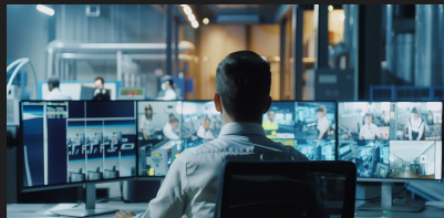
Banking and Finance