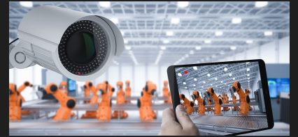
Manufacturing and Industrial