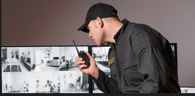
Security and Surveillance